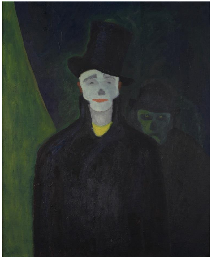
Storm P., Humsti Bumsti , 1945, ARoS, Aarhus Kunstmuseum

In collaboration with the Storm P. Museum